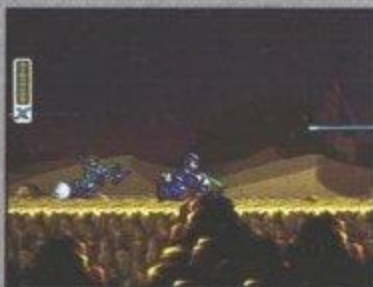
Mega Man X races to the abandoned replid factory today.

A special armada of Maverick Hunters was mobilized today to the production factory, but only one replid has been able to penetrate the heavy artillery outside the factory.